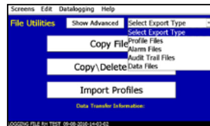
File utility screen