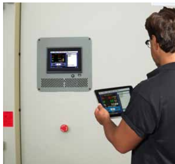
Remote control using smart phone or tablet