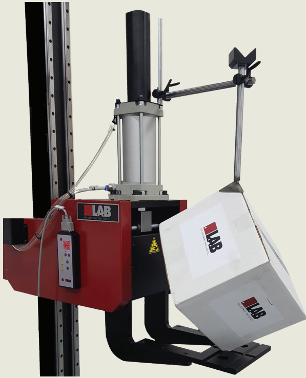
Package Holding Fixture