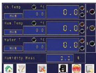
KeyKratos - Main control parameters