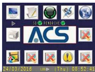
KeyKratos - Main window