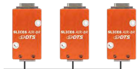
Ethernet Networking and 1588 Sync

A 2-port 10/100Mbit Ethernet switch allows up to 10x modules (60ch) in daisy-chain configuration